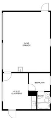
HIDDEN TREASURE 228 Seaview Drive