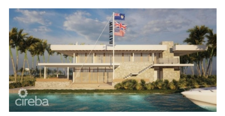
The Sports and Leisure Facilities Plan