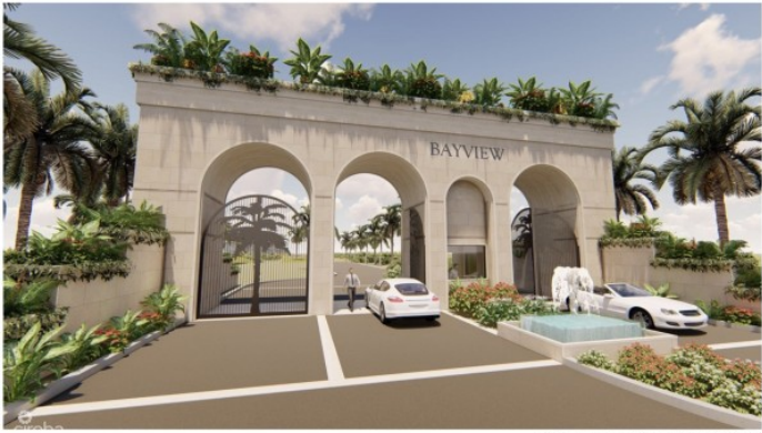
3D VIEW 2 - SECURITY / GATEHOUSE