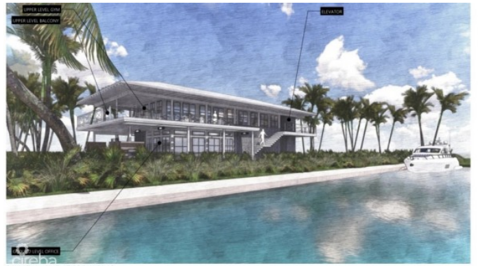
BAYVIEW - AMENITIES BUILDING