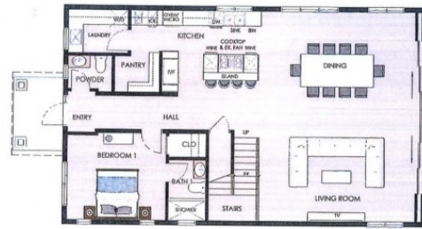
Ground Floor Villa #7 50 ft x 30 ft

Living Dining Room 30' x 22' 3" Kitchen 16' 9" x 13' 4"