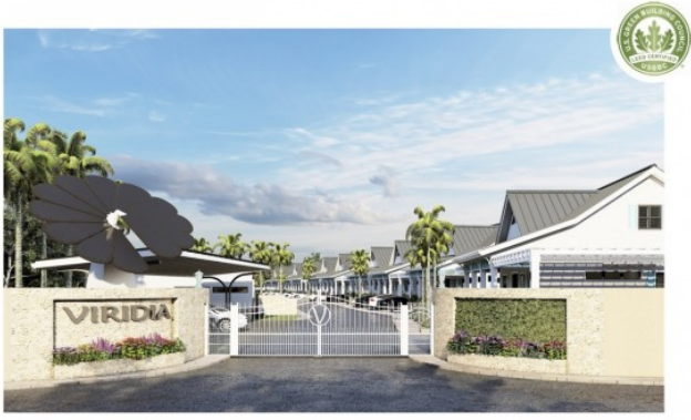
viridya | 3